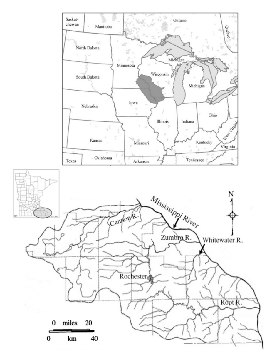
Fig. 1 Maps depicting the Driftless area ( dark shaded area ) covering portions of Minnesota, Wisconsin, Iowa, and Illinois, USA ( top map ) and the rivers and streams in southeastern Minnesota that are tributary to the Mississippi River ( lower map ). Dashed lines represent county borders, major rivers are labeled, and the city of Rochester is highlighted. Most of the region's designated coldwater trout streams lie within the watersheds of the Whitewater River and the Root River